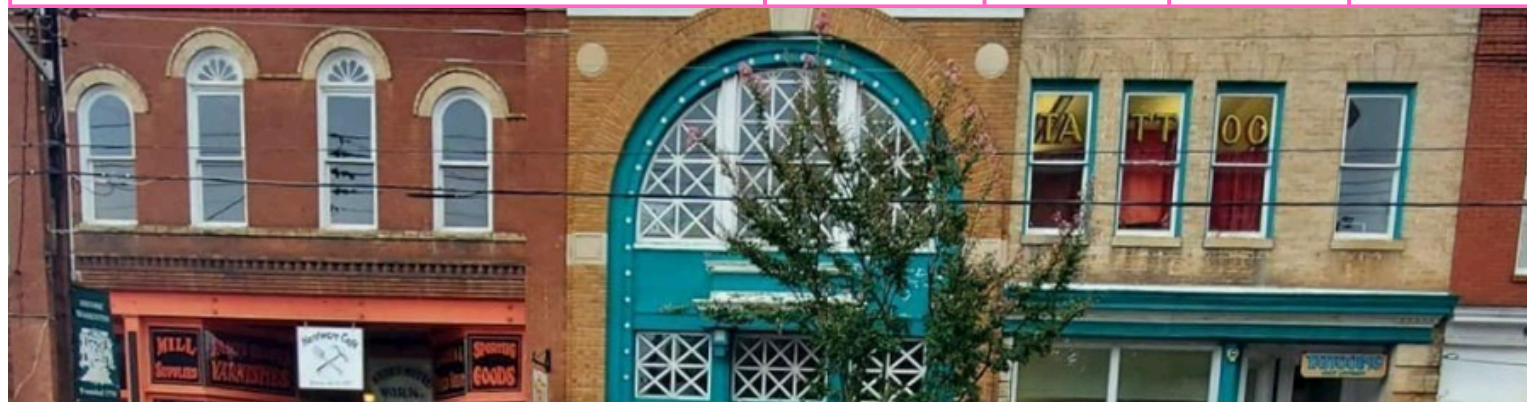
Historic Warren County