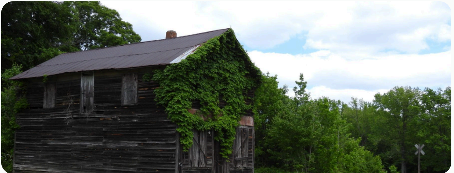
Granville County Historic Store Site